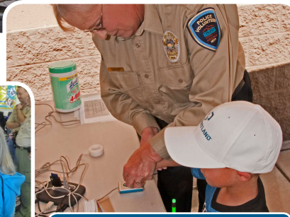
Child safety programs