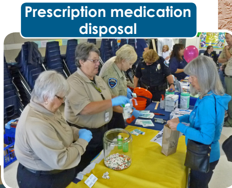
Prescription medication disposal