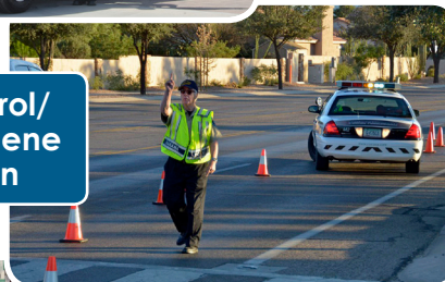
Traffic control/ accident scene protection